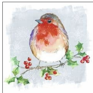
Robin on a Holly Branch