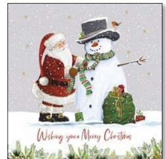
Santa and Snowman