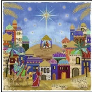
Bright Silent Night

Thanks to generous sponsor Bolt Burdon Kemp , every penny will go directly to supporting brain injury survivors, their families and carers.